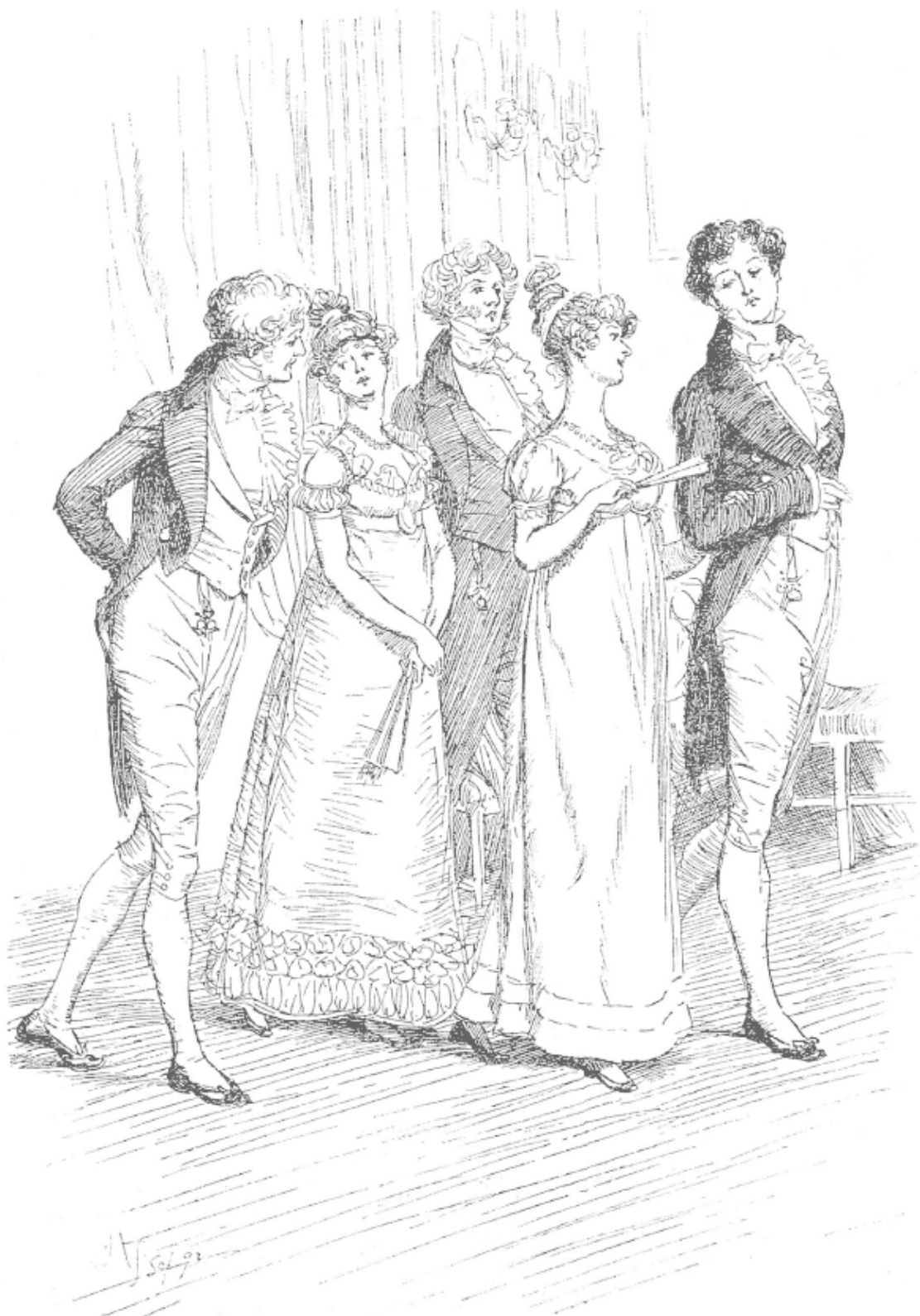
When the party entered

Mr. Bingley had soon made himself acquainted with all the principal people in the room; he was lively and unreserved, danced every dance, was angry that the ball closed so early, and talked of giving one himself at Netherfield. Such amiable qualities must speak for themselves. What a contrast between him and his friend! Mr. Darcy danced only once with Mrs. Hurst and once with Miss Bingley, declined being introduced to any other lady, and spent the rest of the evening in walking about the