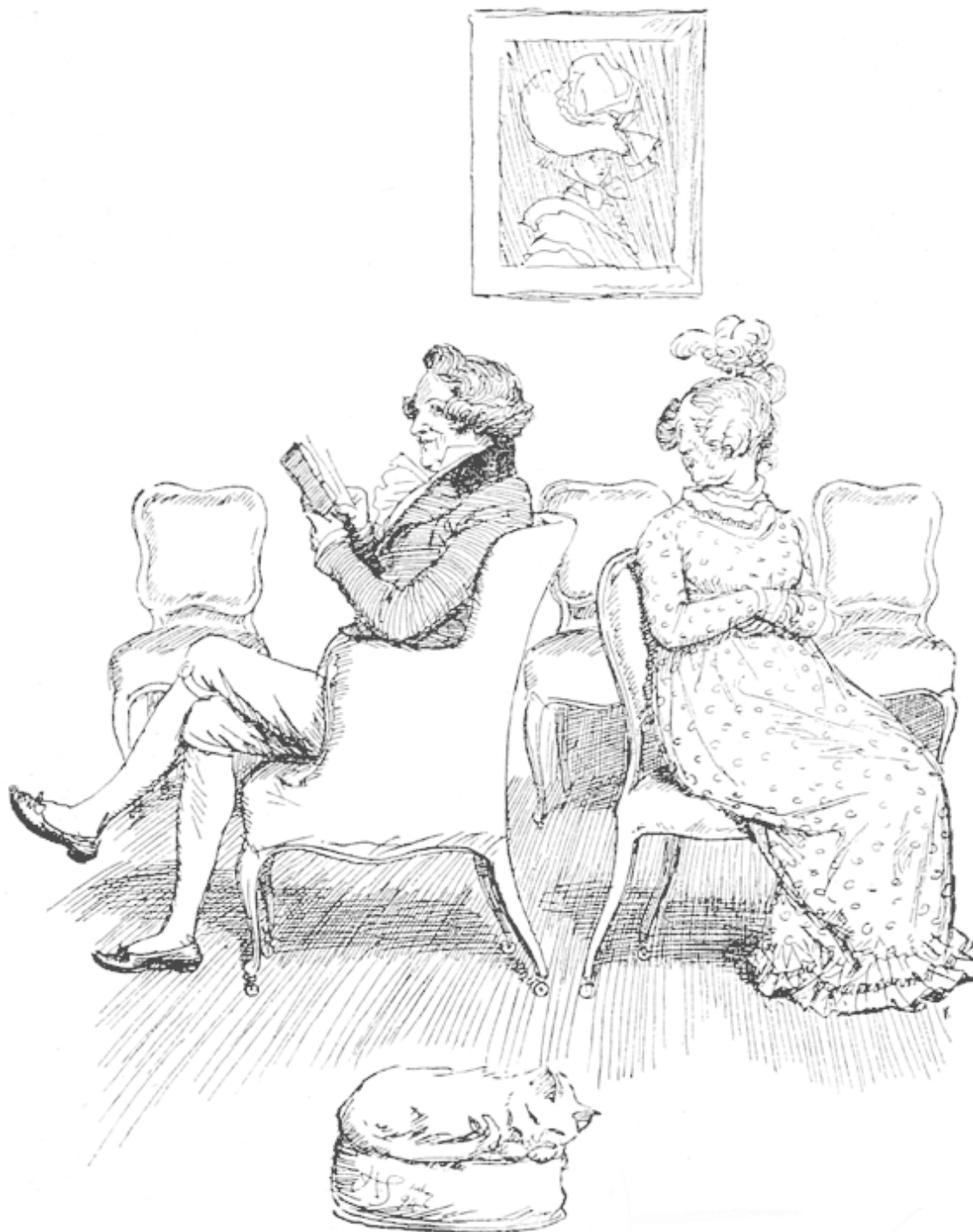
Mr. and Mrs. Bennet

“Depend upon it, my dear, that when there are twenty, I will visit them all.”