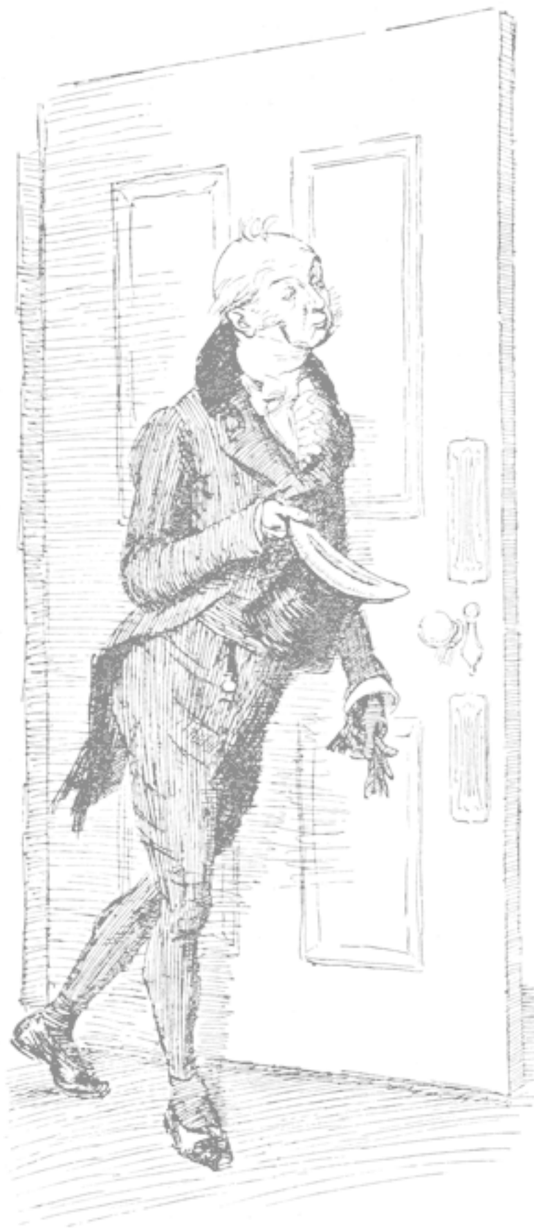
The apothecary came