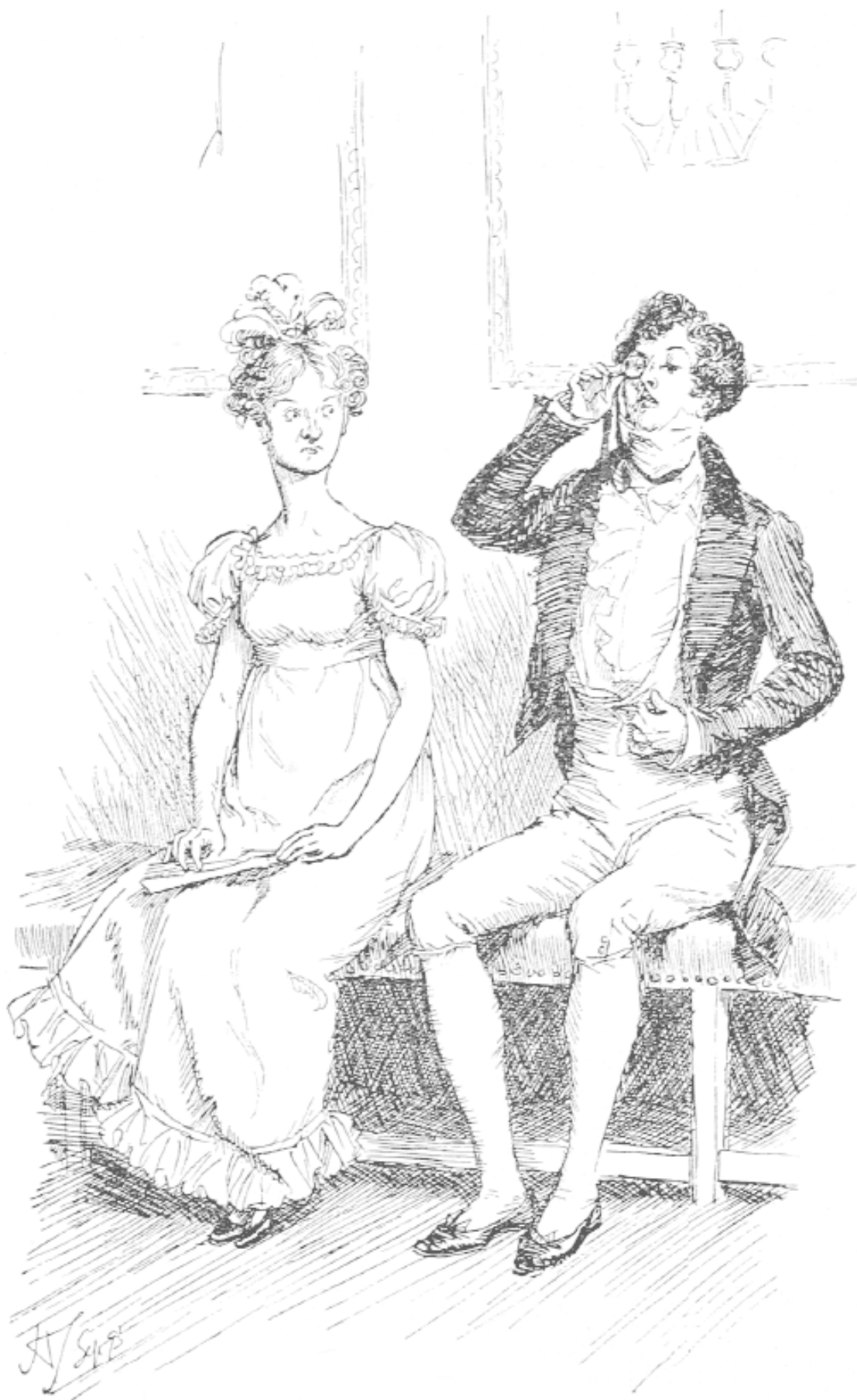
Without once opening his lips