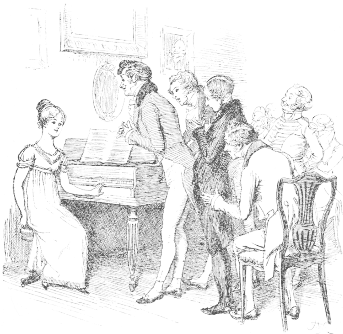
The entreaties of several

Mary had neither genius nor taste; and though vanity had given her application, it had given her likewise a pedantic air and conceited manner, which would have injured a higher degree of excellence than she had reached. Elizabeth, easy and unaffected, had been listened to with much more pleasure, though not playing half so well; and Mary, at the end of a long concerto, was glad to purchase praise and gratitude by Scotch and Irish airs, at the request of her younger sisters, who, with some of the Lucases and two or three officers, joined eagerly in dancing at one end of the room.