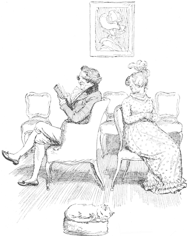
Mr. and Mrs. Bennet